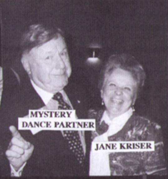
MYSTERY DANCE PARTNER