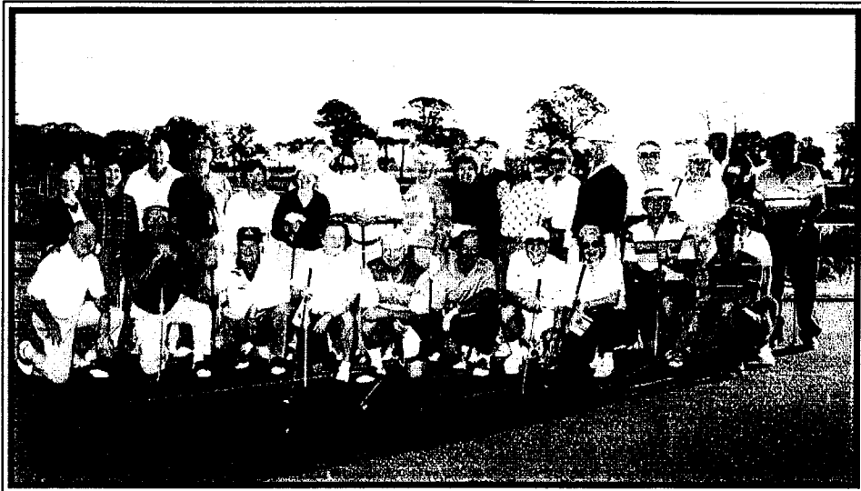
SWINGING GROUP AT ST. AUGUSTINE The weather was great! The course was great! The golf crowd was large! And, the scores were large! (Only kidding.) Yes, we have some real 'baggers' in our midst. Watch out for the fake limp and don't foolishly give away strokes. FORE!